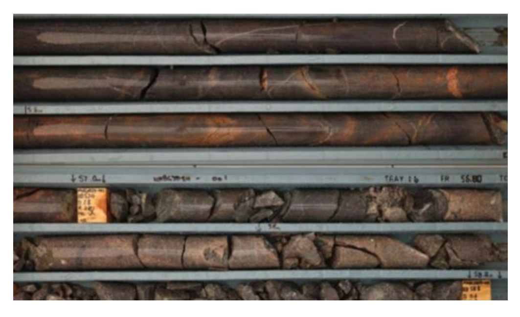
Hornblende bearing diorite (NMBGDD24-001 from 53.65–59.66 metres).

Last updated: 10:35 27 Jun 2024 AEST, First published: 10:19 27 Jun 2024 AEST